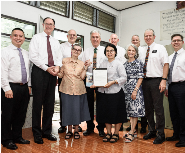
Grant awarded to the Good Shepherd Sisters for the construction of a teaching kitchen.

Caring for those in need is a foundational belief of members of The Church of Jesus Christ of Latter-day Saints in Thailand and throughout the world. Members live by the two great Christian commandments: "Thou shalt love the Lord thy God" and "thou shalt love thy neighbour as thyself," as Jesus taught in the Bible (Matthew 22:37, 39).